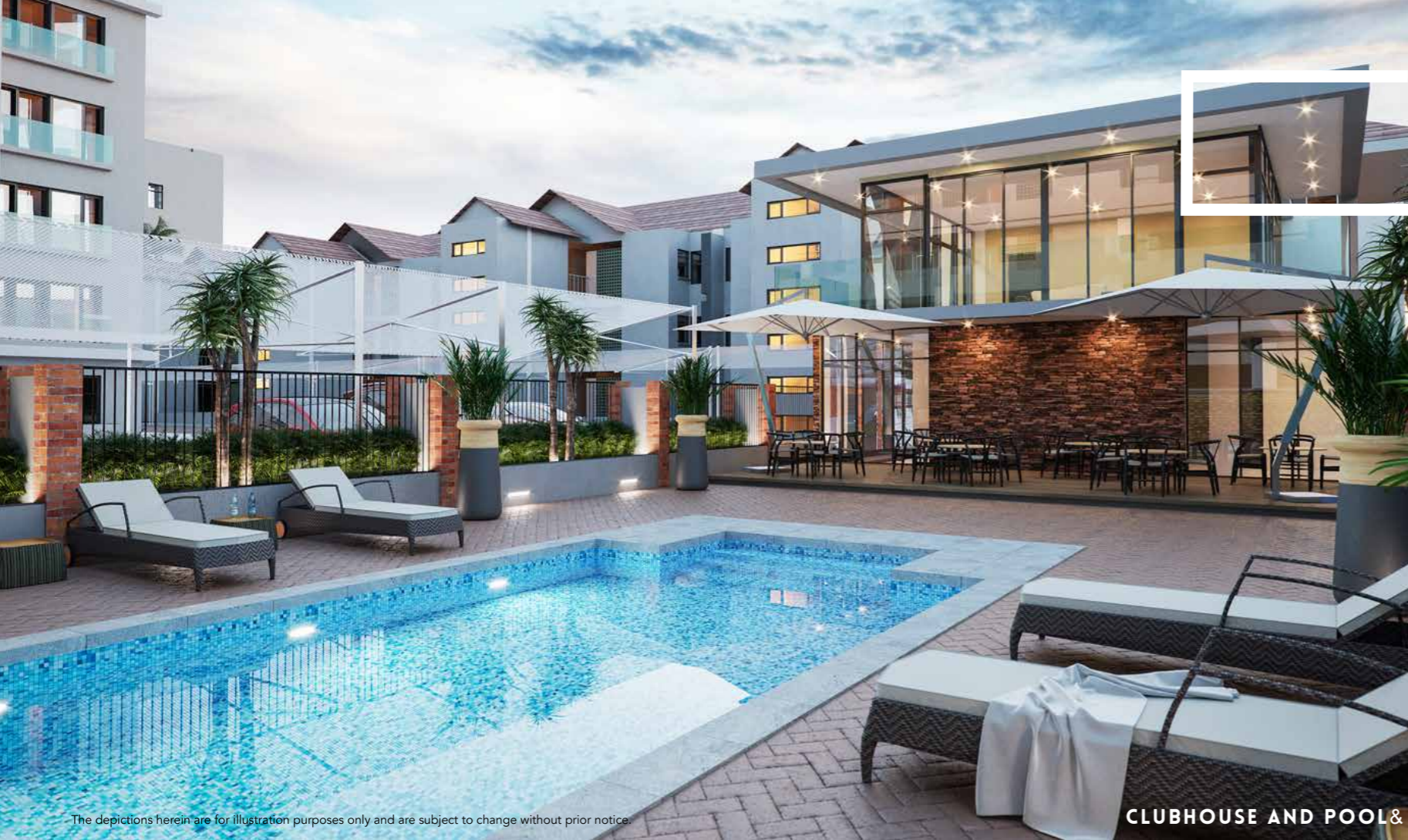
The depictions herein are for illustration purposes only and are subject to change without prior notice.